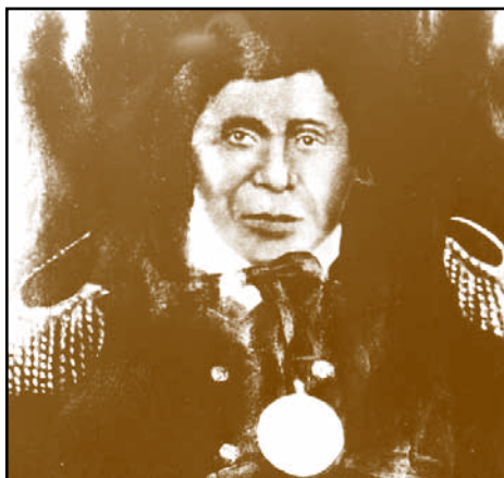
This photo of Chief Buffalo is courtesy of the Wisconsin Historical Society

And being desirous to provide for some of his connections who have rendered his people important services, it is agreed that Chief Buffalo may select one section of land at such place in the ceded territory as he may see fit, which shall be reserved for that purpose, and conveyed by the United States to such person or persons as he may direct.