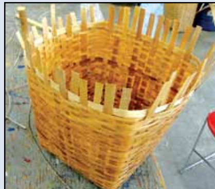
A basket made of black ash wood.

tradition that goes far beyond what can be explained here, but is worth exploring. Ash "pack" baskets were likely used to transport goods by the voyageurs. Ash baskets fetch high prices in the marketplace, with small baskets priced around $50 and larger baskets costing in the thousands. Basketry is not a quaint relic of the past; even today people use this early technology to create and sustain forest-based lives and livelihood strategies. It remains to be seen what the broader implications of the looming loss of this culturally significant species will be.