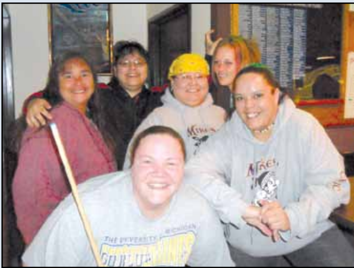
Congratulations Cloquet Bar & Lounge Billiards Champions second year in a row.