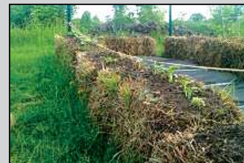
Shannon's straw bale squash row in mid June

I was concerned about the mushroom forest popping up in almost every bale. Mushroom growth IS a good sign that the composting process is happening, but there were tons of them. I pulled many out to clear space for planting and they really have not seemed to be a big deal. They are mostly Inky Caps, which are known for decomposing straw bales and dropping black blobs that look like ink. One observation I did make is that you do not want your plant leaves right near the mushroom heads because when they drop their ink, it sticks to the leaf. One question I have heard from a few people is if I have had a problem with snakes around the bales. I have not seen any yet but I will keep you posted.