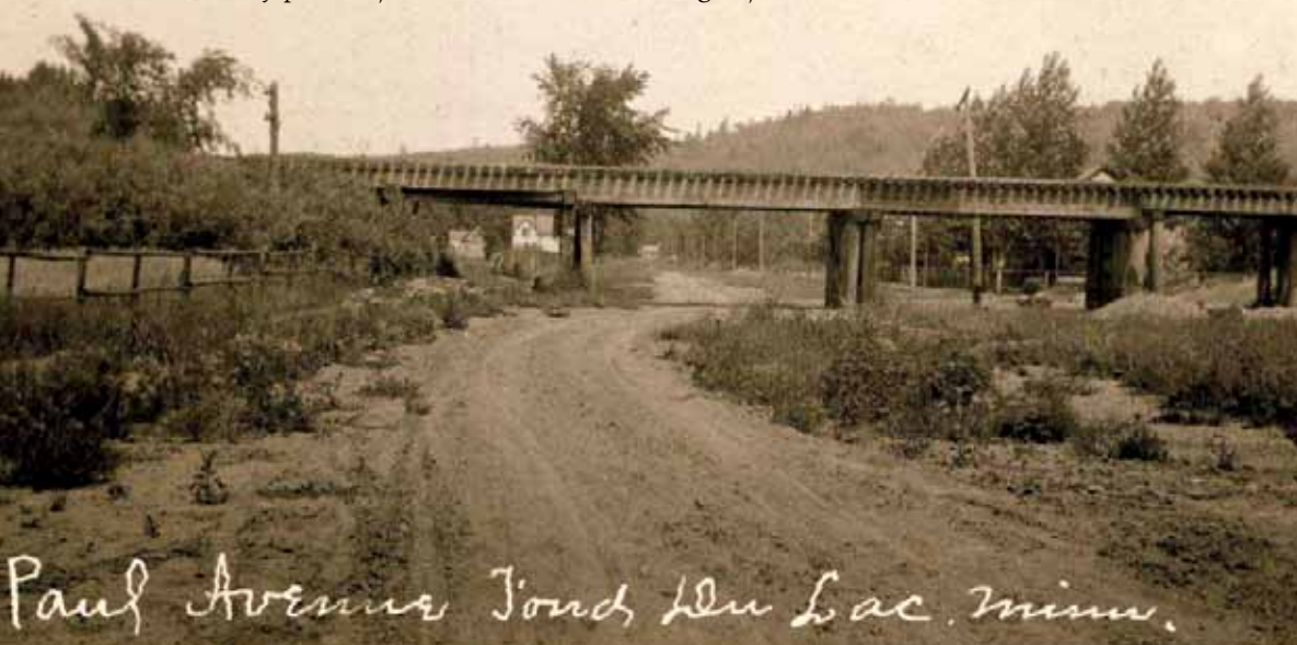
Paul Avenue Fond du Lac, Minn.

An early photo of Paul Avenue in the village of Fond du Lac.