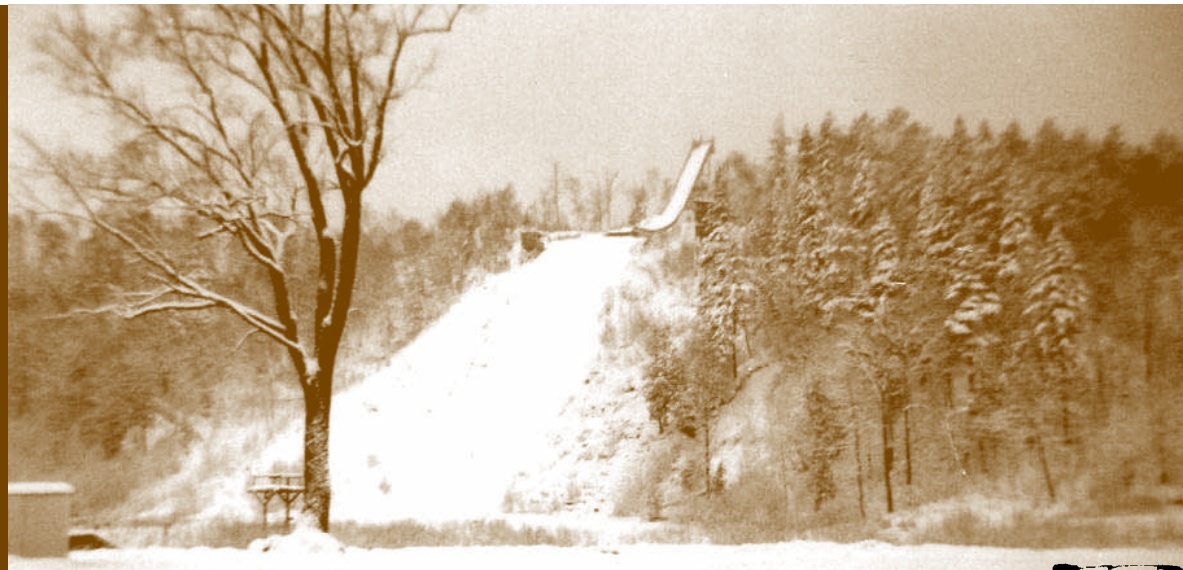
A 1955 photo of the Ojibwe Bowl - Fond du Lac Ski Hill.

“There was but one resource, and this the Indian has at command on all occasions. It is patience.”