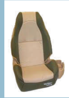
Low Back Booster $10.00 High Back Booster $22.00