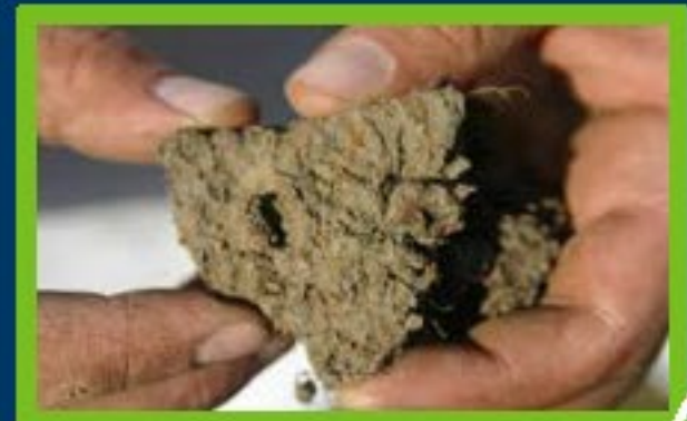
Materials & Soils