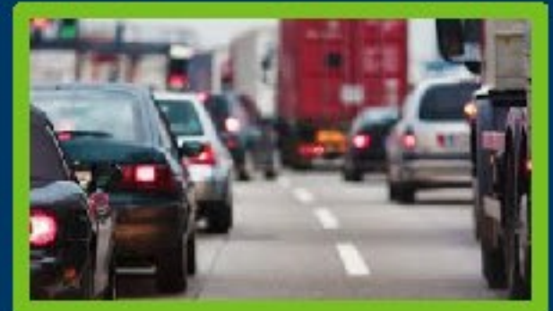
Traffic, Signals & Signs