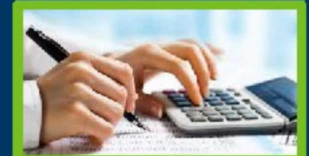
Business & Administration