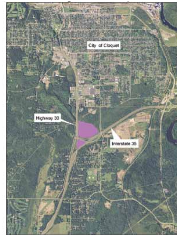
Purple loosestrife locations