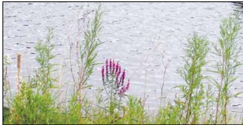
Eurasian Water milfoil

Zebra Mussels - have a dark and white (zebra-like) pattern on their shells, but may be any combination of colors from off-white to dark brown. Zebra mussels filter plankton from the surrounding