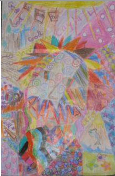
Here is a student's finished piece!! Awesome job, so much detail and it really personalizes it!