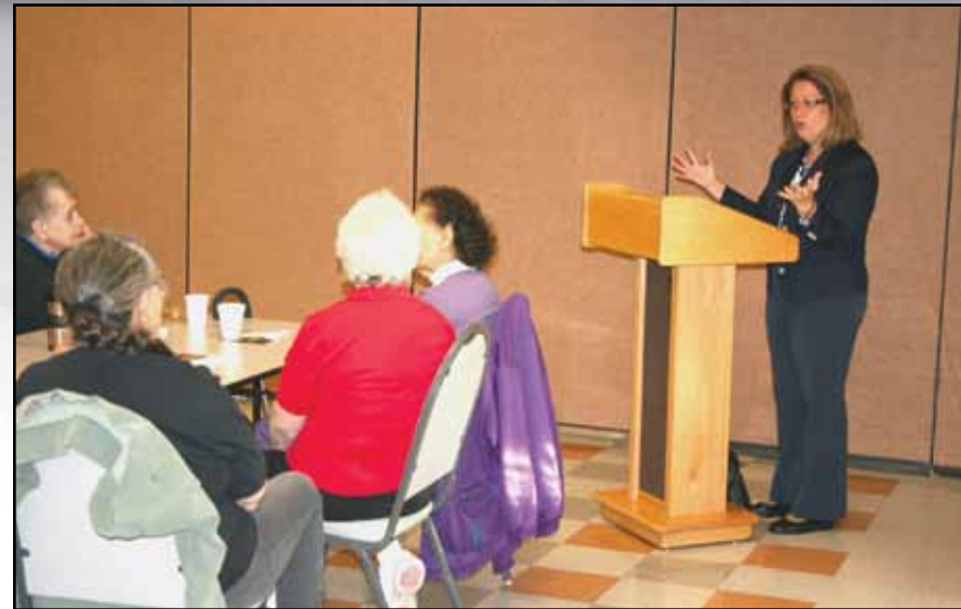
Lt. Governor Yvonne Prettner Solon is answering questions and comments from a group of elders during her visit to the Fond du Lac Reservation Oct. 26. About 30 people attended the meeting inside the Cloquet ENP