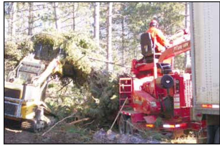
FDL Wood Chipper