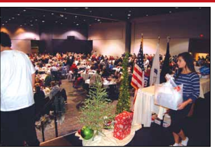
The youth handing out the gifts to the winner's of the