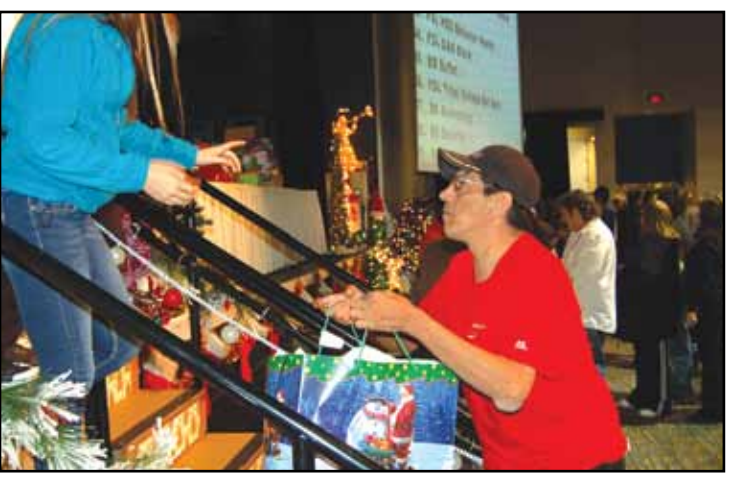
The youth handing out the gifts to the winner's of the